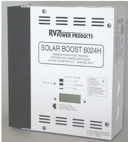
Solar Boost 6024H Pictured with optional digital display

HIGH VOLTAGE INPUT - MAXIMUM POWER POINT TRACKING PHOTOVOLTAIC CHARGE CONTROLLER